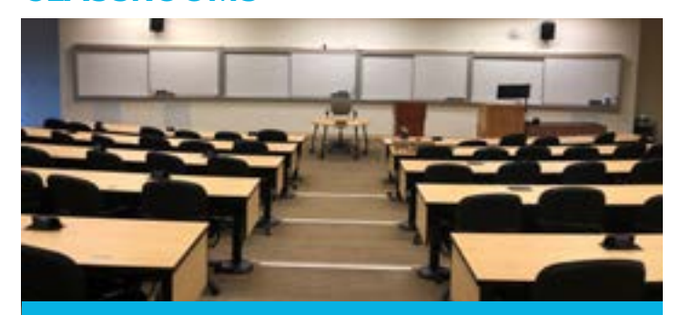
1213 - Seats 76