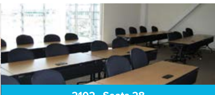
2102 - Seats 28