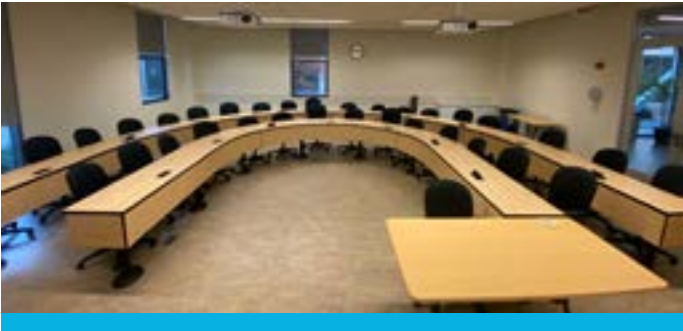
1302 - Seats 34